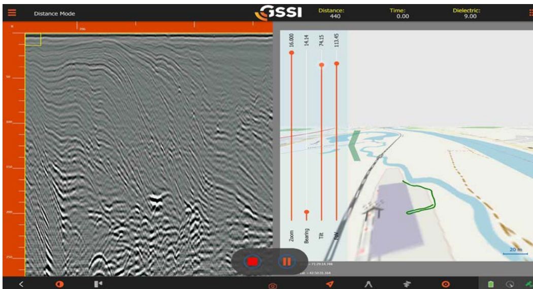
Tablet screen image of 2D GPR data indicative of flood plain deposits located in the Northeastern United States (left) and geographic information system (GIS) data (right).

The GIS map mode will display the GPR data collected on the left side of the screen and a location map on the right side of the screen. This GIS map mode provides position information using a user-selected GPS and serves as a tool to visualize the survey layout.