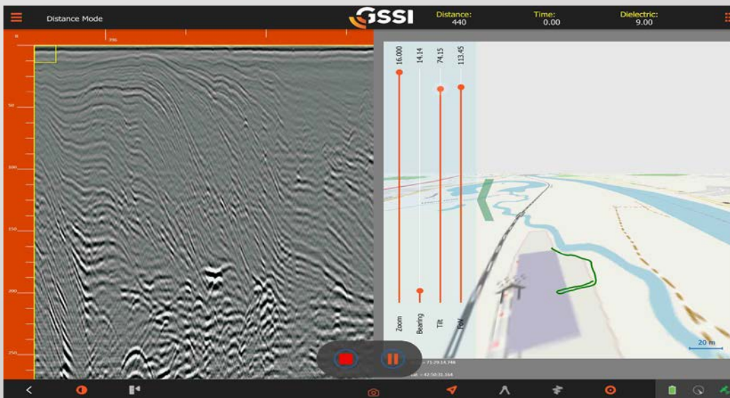
Tablet screen image of 2D GPR data indicative of flood plain deposits located in the Northeastern United States (left) and geographic information system (GIS) data (right).

The GIS map mode will display the GPR data collected on the left side of the screen and a location map on the right side of the screen. This GIS map mode provides position information using a user-selected GPS and serves as a tool to visualize the survey layout.