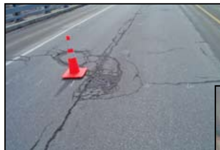
Top of bridge deck (left) View of underside of bridge deck (bottom)

The vehicle was driven across the bridge aligning the antenna as close as possible to the paths used by the ground coupled antenna.